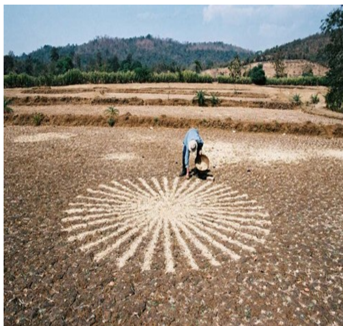
Making paddy-field chaff circle, Warli tribal land, Maharashtra, India 2003